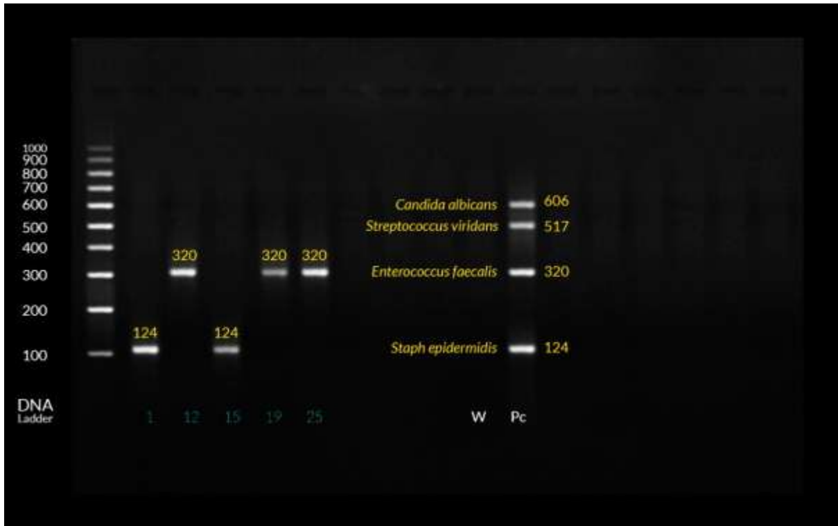
Fig. 2: Agarose gel electrophoresis of PCR amplicons of 2 nd multiplex PCR reaction

Where; Lane 1: DNA ladder (Thermo Scientific Gene Ruler 100bp DNA Ladder): used as a DNA size marker; Positive bands were detected at: 124 for Staph. epidermidis (2 cases: no. 1, 15); 320 bp for E. faecalis (3 cases: no. 12, 19 and 25). No positive bands were detected for S. viridans at 517 or C. albicans at 606. *Pc (1st Lane on right): Positive control; *W: water as negative control